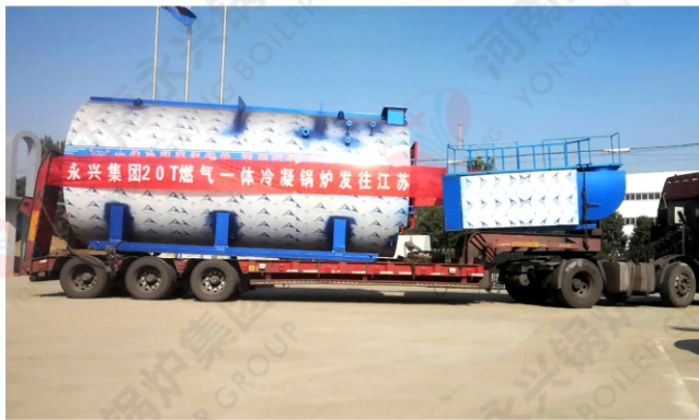
2018.09.28 20吨燃气一体冷凝锅炉发往江苏 2018.09.28 20t/h integrated gas fired condensing boiler to Jiangsu