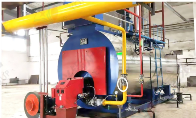
2018.09.21 神华集团6台10吨冷凝蒸汽锅炉 2018.09.21 6 sets of 10t/h condensing steam boilers in Shenhua group