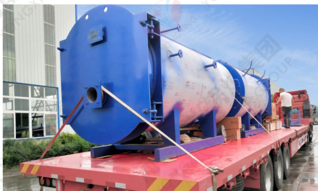
2018.06.08 江苏碧博士纺织品有限公司2吨燃气蒸汽锅炉 2018.06.08 2t/h gas fired steam boiler in Jiangsu Biboshi Textile Co.,Ltd