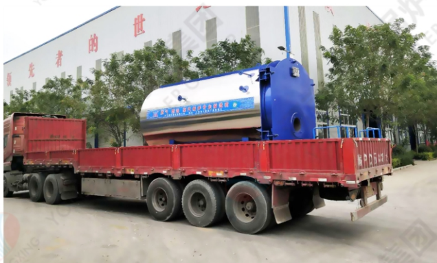
2016.12 天津宝坻泰富洋服装厂2吨蒸汽锅炉 2016.12 2t/h steam boiler in Tianjin Taifuyang garment factory