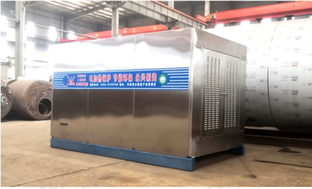
2017.02 周口扶沟县德瑞皮革制品有限公司1.4MW常压热水锅炉 2017.02 1.4mw atmospheric pressure hot water boiler in Zhoukou Derui Leather Products Co.,Ltd