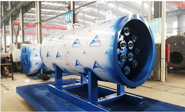
2015.01 陕西神木县宾馆0.7MW电热水锅炉 2015.01 0.7mw electric hot water boiler in Shanxi hotel