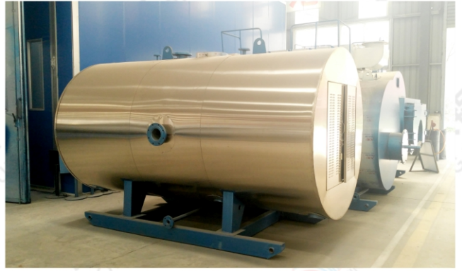
2017.01 山西茂鼎饮品有限公司2.1MW常压热水锅炉 2017.01 2.1mw atmospheric pressure hot water boiler in Shanxi Maoding Beverage Co., Ltd